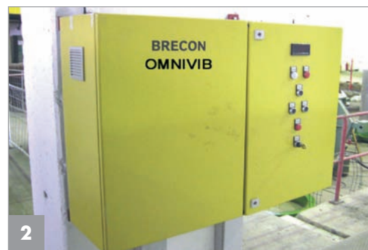
Central control unit of the wall mounted Omnivib-Systems

The constant customer input and technical support from Brecon GmbH, during realization period, was instrumental in the decision for this system.