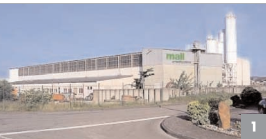
The company Mall Umweltsysteme GmbH in Nottuln, Germany