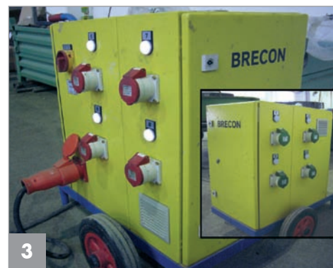
Mobile control unit for SL-vibrators (red) and conventional vibrators (green)