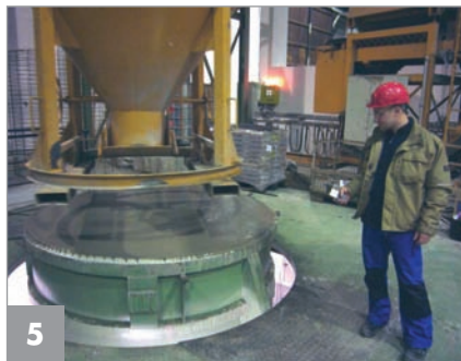
Control of the consolidation process by radio control.

The required flexibility in production of small elements has been realized by a mobile control unit. With the mobile control unit they can either run SL-Vibrators (red CEE-outlets) as well as standard high frequency vibrators (green CEE-outlets) from the other plants (Fig. 3). With two different types of outlets, wrong connections